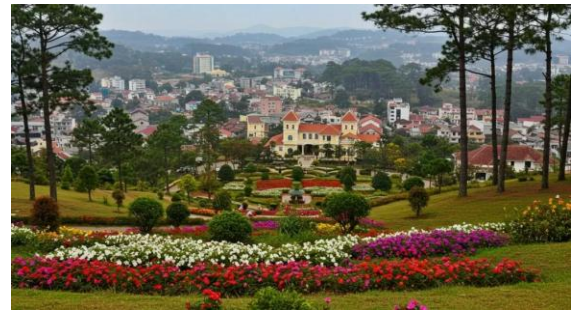
The highland resort town of Dalat

Looking at the current state of the world, it sometimes seems like a scene from hell. Shouldn't we respect each other more and get along peacefully? Japan and Korea admired the West and worked hard to become advanced nations. Yet, not everything has gone smoothly; many problems remain.