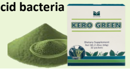
SRP$30 /32 packs

Magnus News is a monthly newsletter for Magnus members. Prices listed on this Newsletter are retail prices. Members have a significant discount on all products. For more information on becoming a member of Magnus, please call or visit magnusamerica.com .